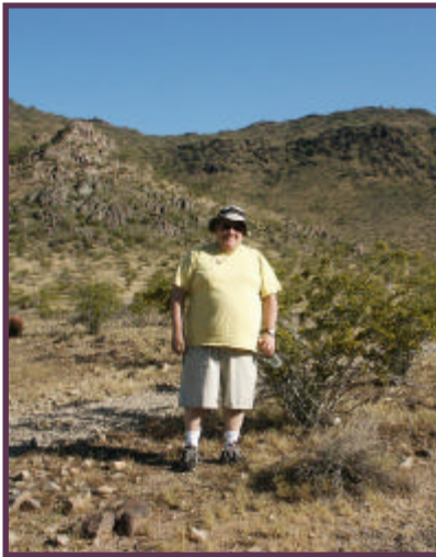
“Walk, walk, walk!” That’s all I seem to do. Now its even for fun. It was a beautiful spring day in the desert.