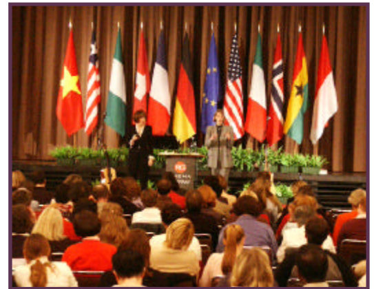
We were blessed with nearly 350 people from all over Europe who attended the two-day prayer conference in Bonn.