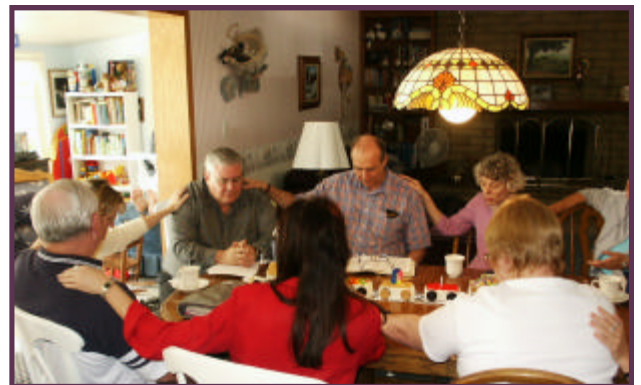
Above: At GateView Ministries’ GateKeepers Bible Study in Tempe, Arizona, where I got blessed by being prayed for and with a chance to share the Word and the vision of First Step Ministries, Inc.

Later that evening, they prayed for an increased anointing in the area of music in my life. I will receive that in Jesus’ name.