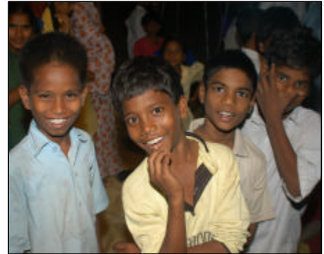
India's future championship Cricket Team for 2014

program to do this. As this program develops, I'll keep you posted on the details.