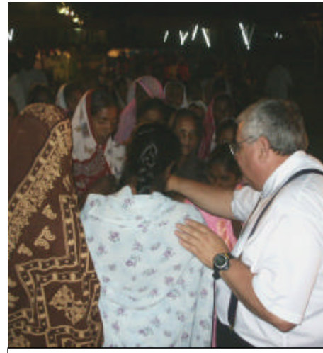
Praying for a local woman with the help of a local pastor's wife.