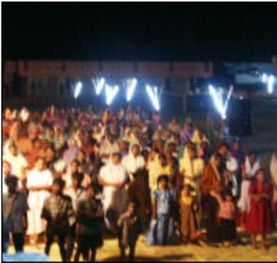
Above: Over 1,000 people attended each evening of the four-day, open-air convention in Pangidi.