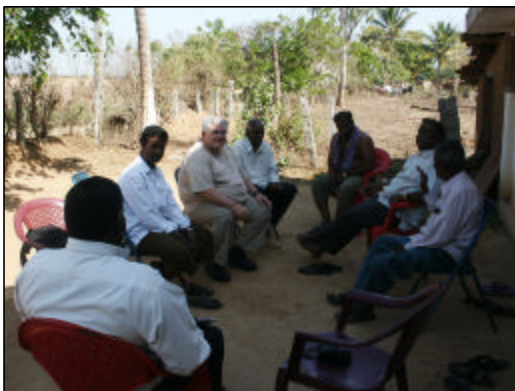
A Saturday morning meeting with the local pastors.