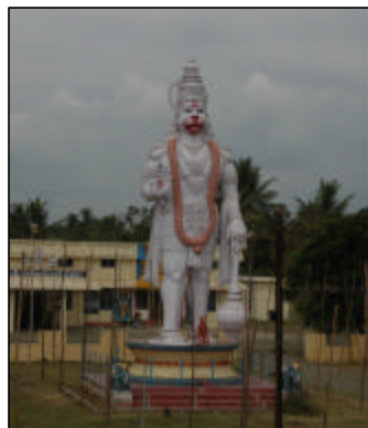
Two of the million Hindu gods found all over India. Note the size of these statues.