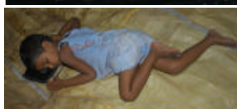
Above: One of our over-night trains. It was interesting. Left: "Just resting on The Word of God" The Bible is her "pillow".