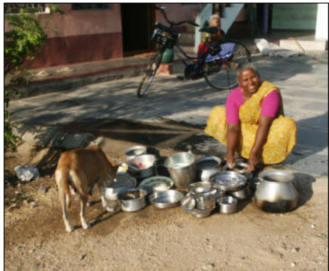
It seems that "everybody" helps cleaning pots & pans. I think he is the "Pre-Wash" cycle.