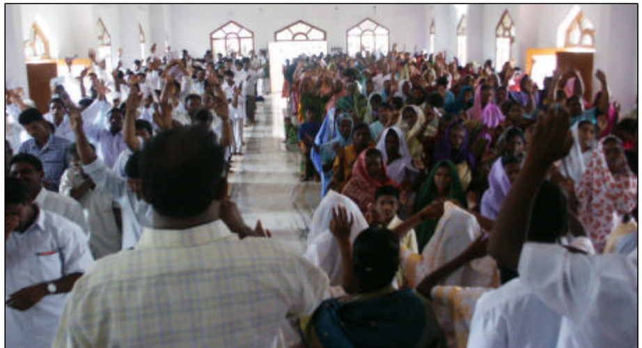
One of the afternoon meetings at the four-day convention in Pangidi, India