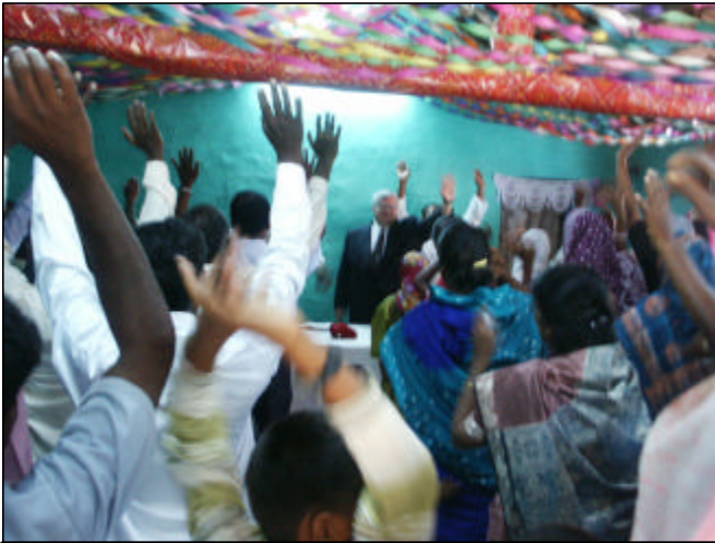
Easter Sunday Service Praising The Lord, "He has risen!!" "Yes, He has risen indeed!!!"