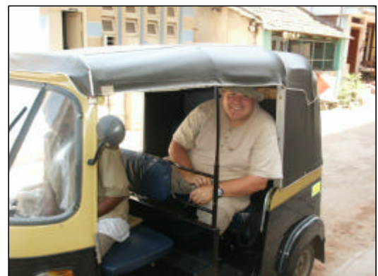
Transportation in India. Don't laugh, you can't imagine how much you can stuff in an "Auto".