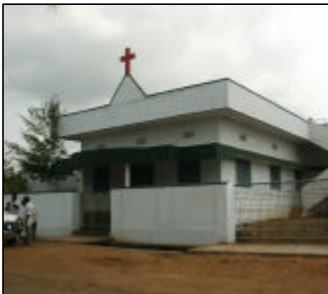
The first meeting in the Indian town of Visakhatnam.

As I reviewed the travel and meeting schedule sent me