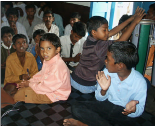
From Left to Right: A future pastor , (the little boy mentioned on Page 4,) a drummer and worship leader .