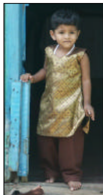
Ministry is about all of God's kids.